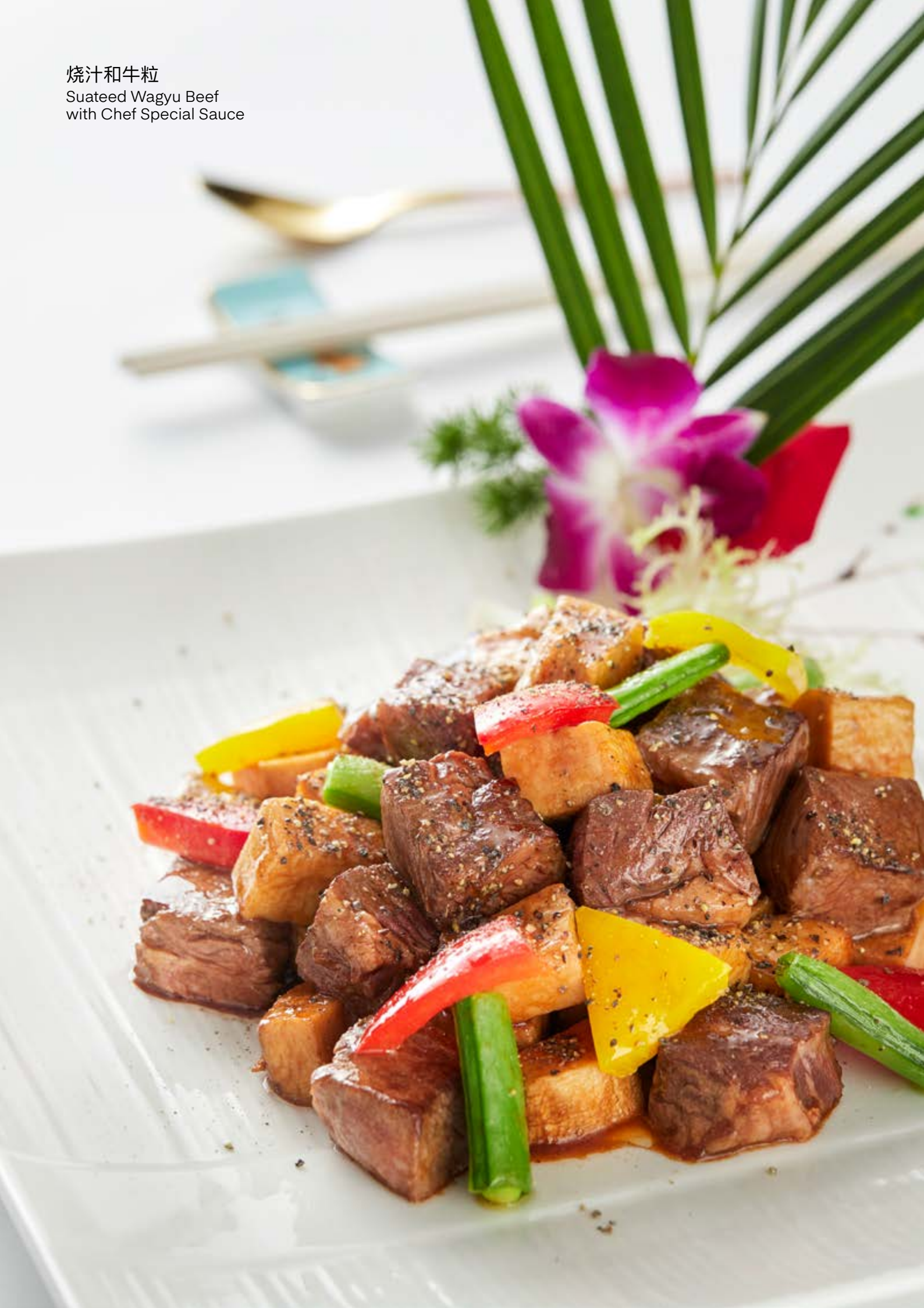
烧汁和牛粒 Suateed Wagyu Beef with Chef Special Sauce