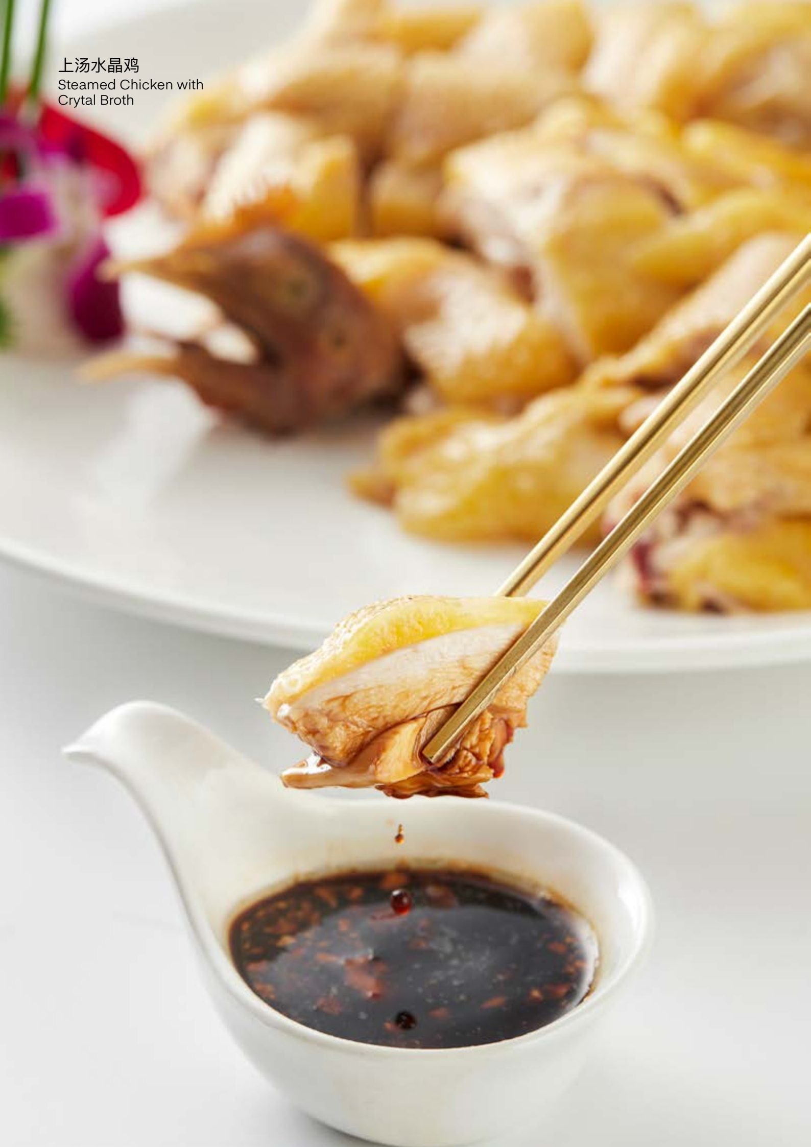
上汤水晶鸡 Steamed Chicken with Crystal Broth